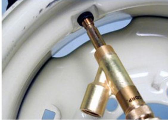
Pushing on the hand wheel forces the sleeve over the housing.