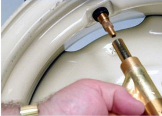
The sleeve is split to slide over the core housing.