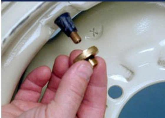
When the tire has a TR-13 or TR-15 stem, install the small bore core removal plug in the end of the core ejector. This will allow you to remove and reinstall just the valve core. You will also need to use the adapter for the standard valve.