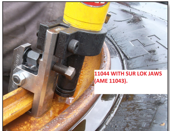
11044 WITH SUR LOK JAWS (AME 11043).

2347 Circuit Way Brooksville, FL 34604 352.799.1111 - sales@ameintl.net