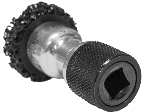
1/2" Drive Socket