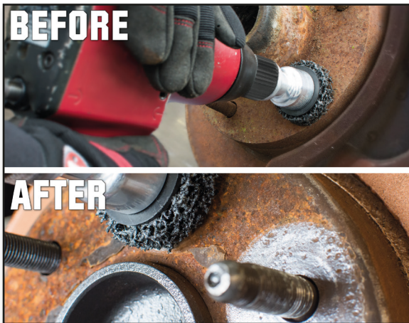
*Impact wrench not included